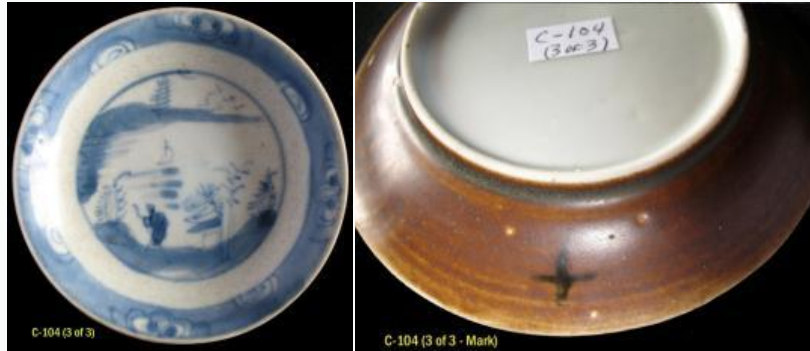
Fig. 2 - Catalogue Number C-104 - Saucer with brown exterior, Qing Yong Zheng period (1723 to 1735), circa. 1725, recovered from Ca Mau shipwreck, Vietnam, acquired in Saigon, (C-104).

The only other known piece with a mark from the Ca Mau shipwreck is a saucer with brown exterior (see Fig. 2 - Catalogue Number C-104 ). This saucer has the very unusual feature of an underglaze mark in the form of a “+” representing the Chinese character signifying the number ten. The mark is inscribed in blue, but has assumed a distinct blackish hue under the brown glaze of the exterior side of the saucer.