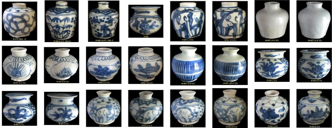
Appendix 4 - Swatow Indonesia Wreck Jarlets (32) in Collection of Writer-2