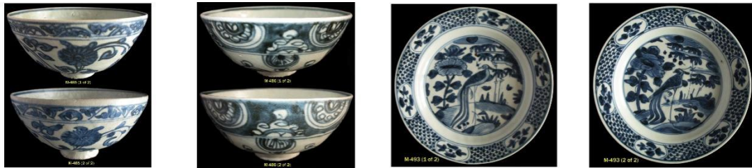
Appendix 4 - Swatow Indonesia Wreck Bowls & Plates (10) in Collection of Writer - 4